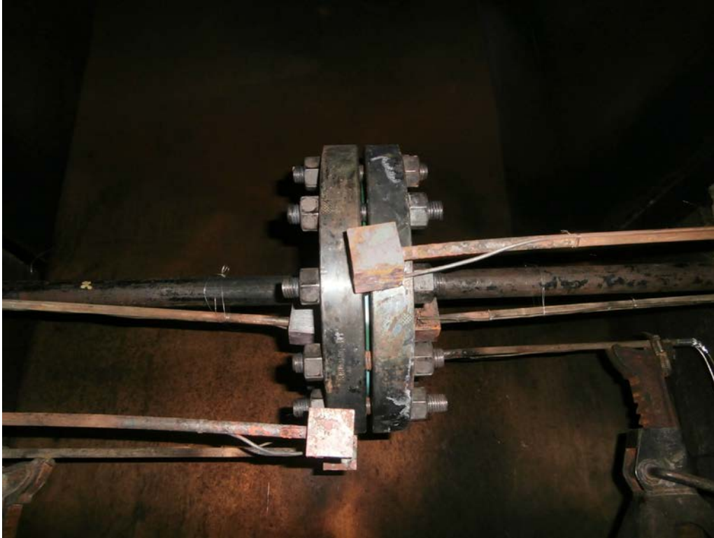
Test Setup Prior to Burn