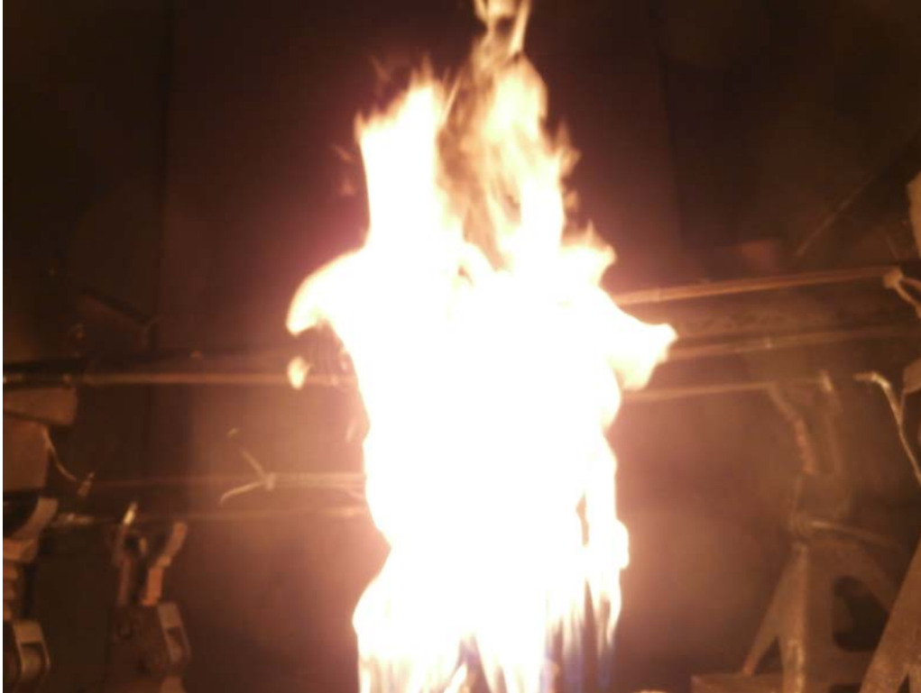
Test Gasket During Burn