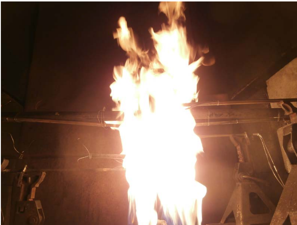
Test Gasket During Burn