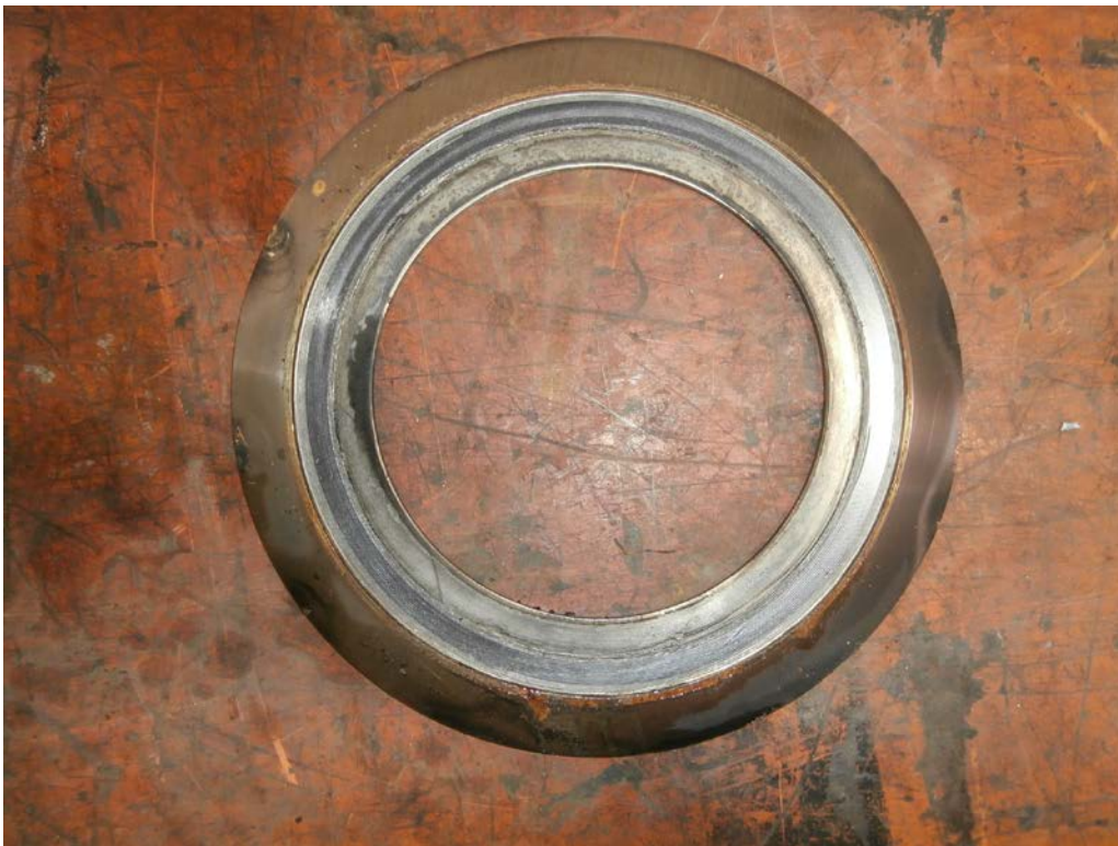
Test Gasket Post-Burn