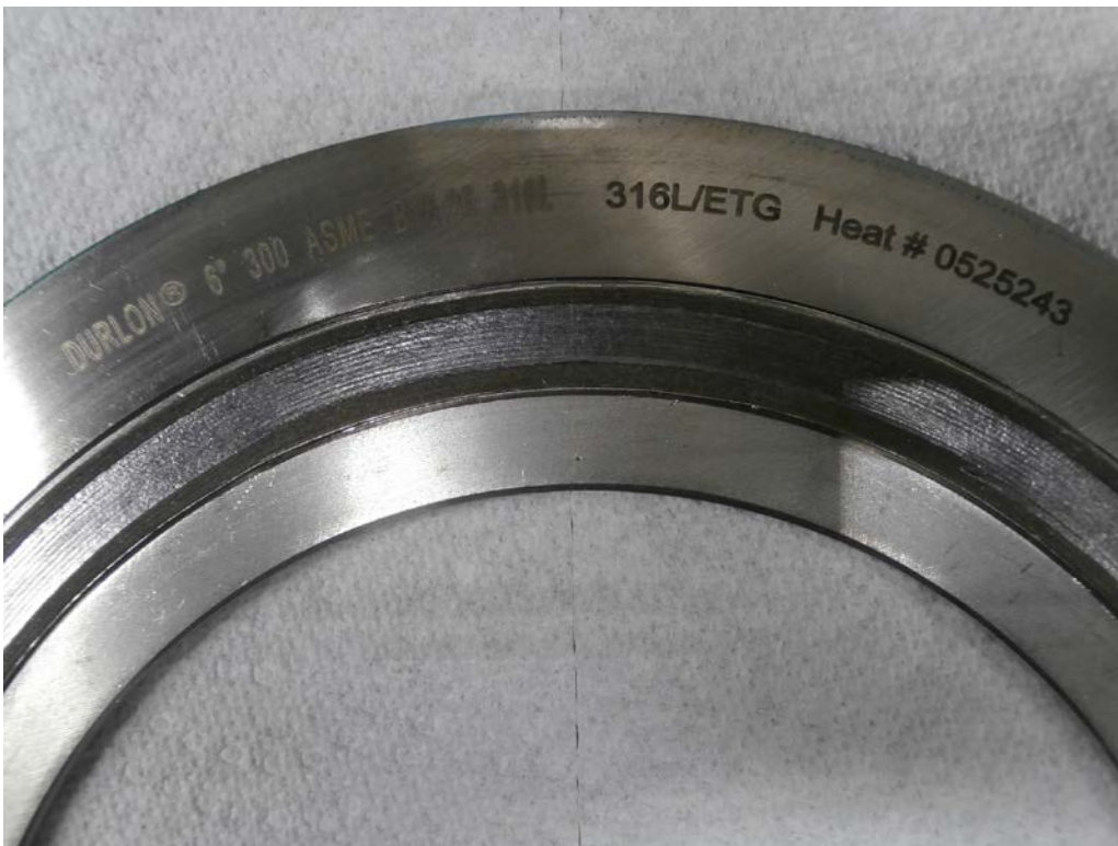
Test Gasket Prior to Burn