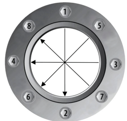
Star Pattern Diagram

NOTE: Flanges are not included in the kit. Contact our Technical Department for more information about Installation, Bolt Torquing, the Star Patterns, and Load Values: tech@durlon.com