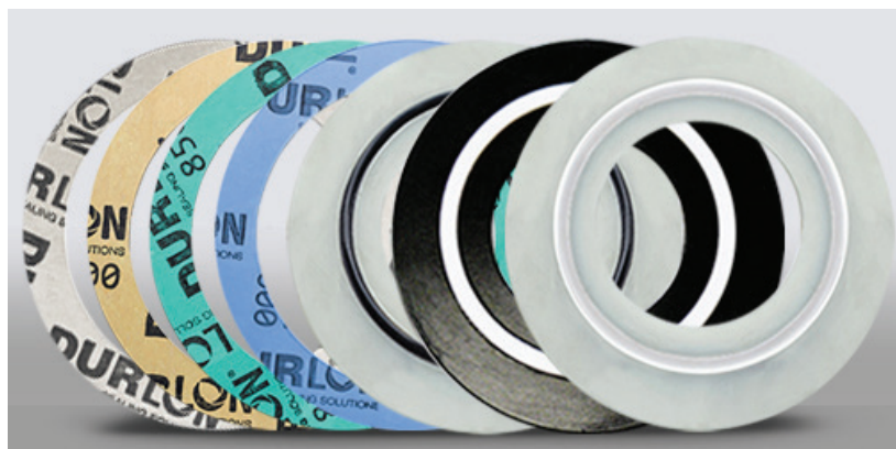
Gaskets Durlon® 7910, 8400, 8500, 9000, EN, CS, HC