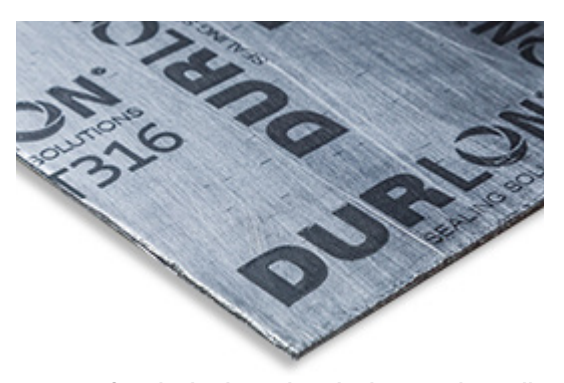
FGT316: Standard industrial grade sheet mechanically bonded on both sides of a 0.004" thick 316 stainless steel tang core. This product is used where stresses and pressures are high and improved handling is important.