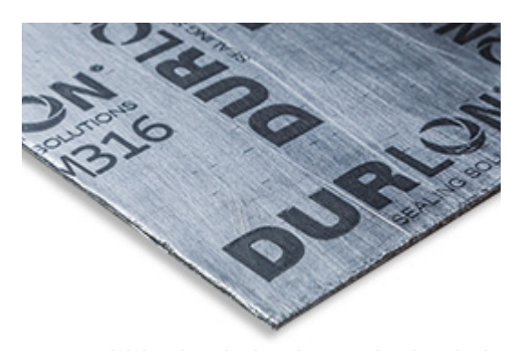
FGM316: Inhibited grade sheet laminated with multiple layers of 0.004" thick 316 stainless steel foil core. This product is used in applications with high mechanical stress or pressure, above average burst resistance, exceptional rigidity, and suitable to cut gaskets with narrow strips.