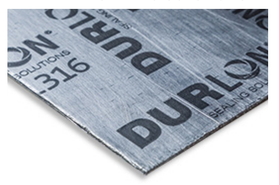
FGL316: Standard industrial grade sheet laminated with an adhesive bond on both sides of a 0.002" thick 316 stainless steel foil core. This product is used where high performance and handling are important.