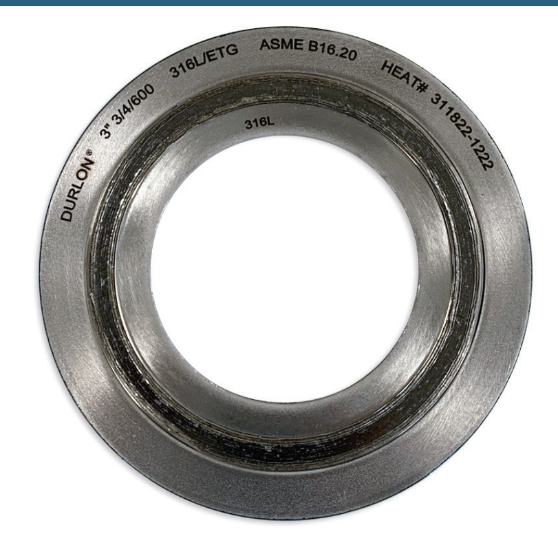
The Durlon<sup>®</sup> ETG's design is the sealing industry's current best available technology for effectively sealing extreme temperature applications.