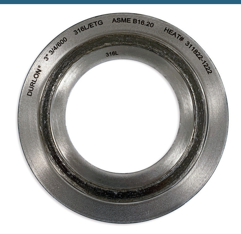
The Durlon<sup>®</sup> ETG's design is the sealing industry's current best available technology for effectively sealing extreme temperature applications.