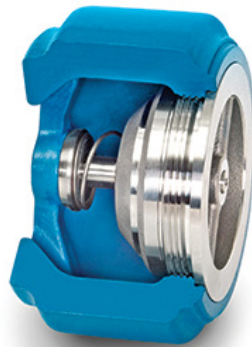
DFT® WLC® Check Valve

Due to the rapid closure spring-mechanism, the negative effects of water hammering were significantly reduced, which added protection to the piping system and reduced the maintenance costs involved.